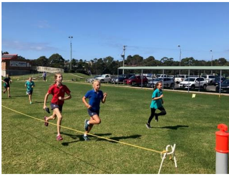
Some of our runners in action!