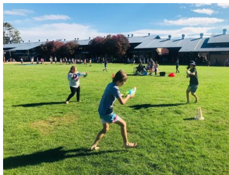
Water pistols were a hit on the day!