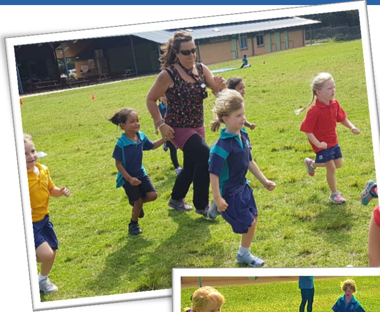
K-2 Cross Country Fun!

Resources: As part of Literacy groups, Year 2 children will be completing STEAM (Science, Technology, Engineering, Art, Mathematics) design activities. To assist with this, we would appreciate it you could send in unused shoe boxes, cereal containers, pegs, rubber bands etc.