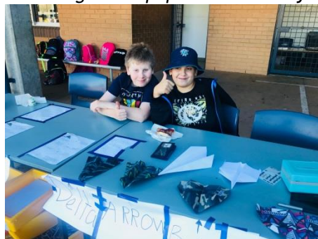
These creative scientists put their skills to good use, teaching students how to make cool paper planes using camouflage paper and tricky designs!