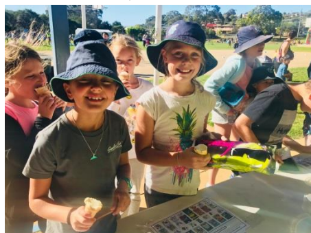
Showbags were popular on the day.