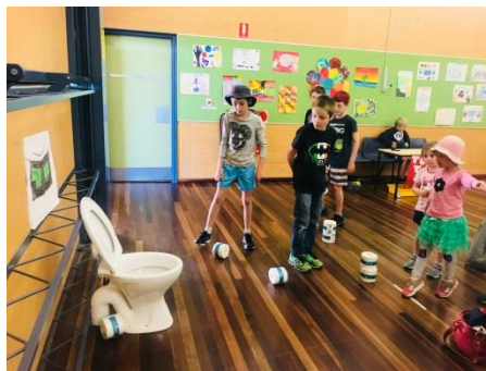
The toilet toss was a fun indoor activity!