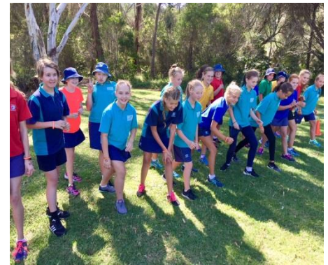
12/13 Year girls ready to race!

See our Facebook page for more Cross Country pictures!