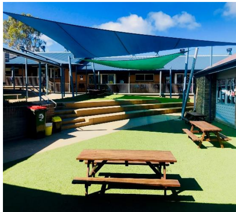
Our K-2 eating area and tables (purchased by the P&C) have been moved to a warmer area without all of the echoing. Pictured are our recycling and compost bins. Our big red rubbish bin will not be there in Term 4!