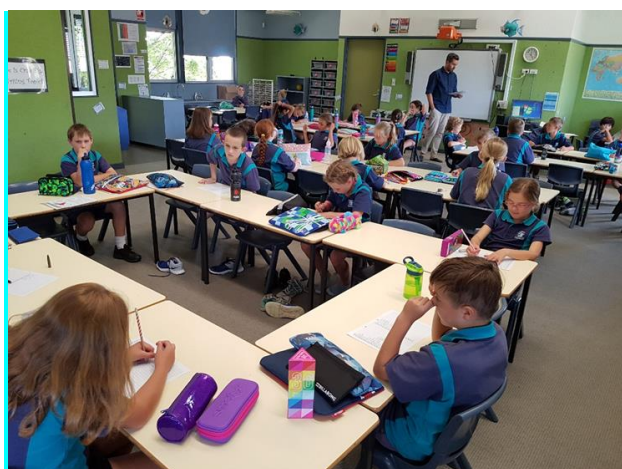
Year 4 Enjoying their collaborative classrooms

We thank you for supplying your children with all the school supplies that they need within the classroom each day. Please ensure your child has the necessary equipment for their day at school. Students will be bringing home their exercise books to cover at home. It would be wonderful if you could support and assist them in covering these books to help protect them throughout the year. We look forward to another exciting term educating your children!