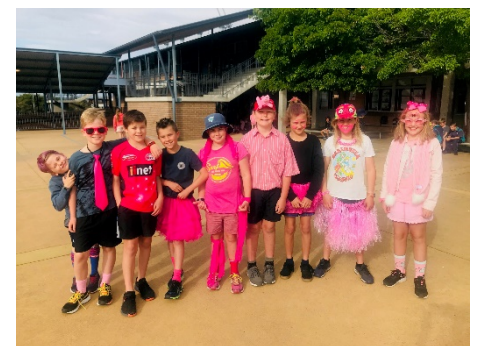
Stage 2 and 3 students Wear It Pink!

Supplies: The start of each term is a great time to check that your child has all of the supplies that they need for school, including lead and coloured pencils/textas, pens, rubbers, sharpener, scissors, whiteboard markers and glue.