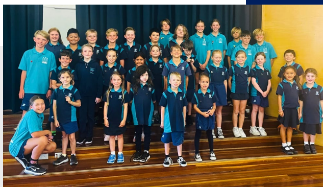
< Semester 1 SRC Representatives